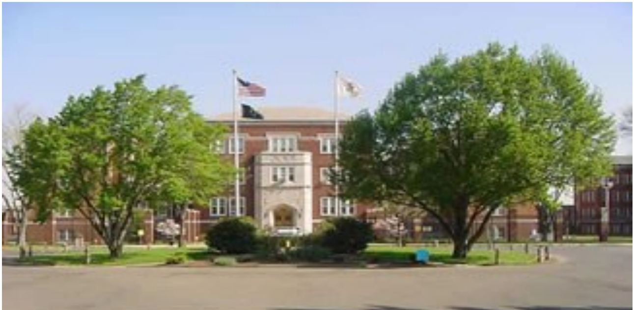
Albert C. Wagner Youth Correctional Facility